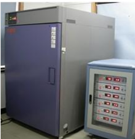
Endurance wheel bearing life test

Our laboratories are also equipped with measurement and control devices that allow us to perform the most advanced tests on product quality and duration: dimensional tests, high temperature tests, life tests and metallurgical controls