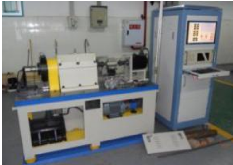
Torque wheel bearing test machine