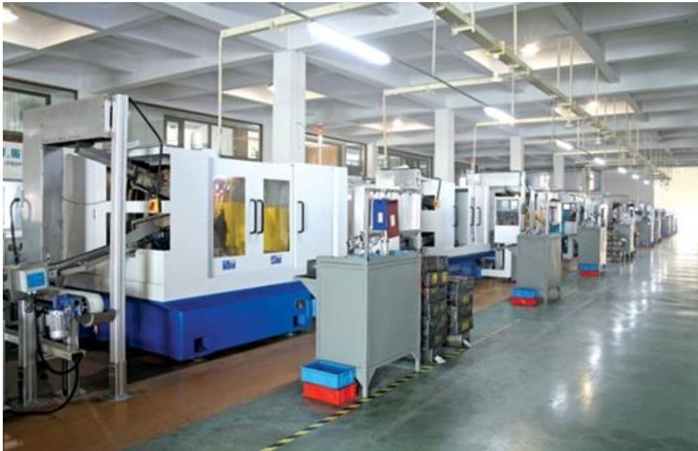
Automatic grinding machines