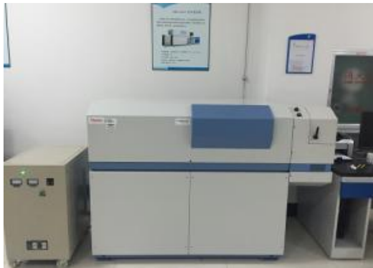
Direct reading spectrometer