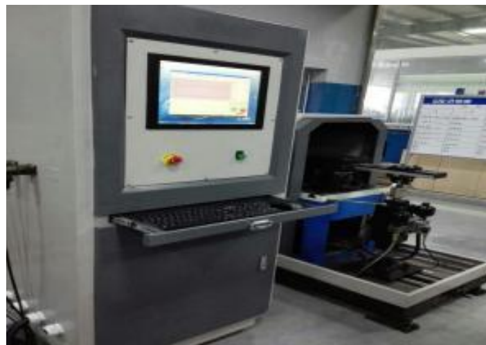
Micro motion wheel bearing Test